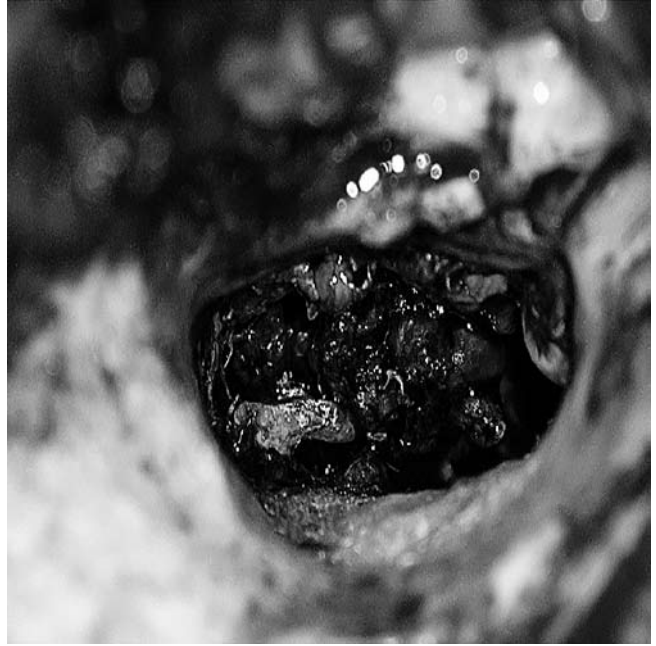
Fig. 2. Intra-operative view: a violet multilobated mass involved the middle ear but the ossicular chain was intact.

The histological examination revealed aggregates of capillary micro-vessels in a lobular arrangement. Architecture of blood vessels showed that they were incomplete and were surrounded by hyperplastic cells. These aspects, together with the positivity to GLUT-1 at the immuno-histochemical evaluation, confirmed the diagnosis of capillary haemangioma.