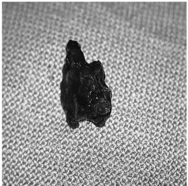
Fig. 3. The lesion was totally removed after a canal wall up tympanoplasty.

The post-operative course was uneventful and post-surgical audiometry examination showed resolution of the air bone gap (PTA = 45dB). The patient is still free of disease at 3 years' follow-up.